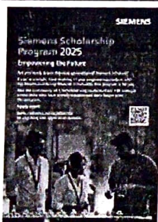
SSP Poster_2025.jpg 1994K